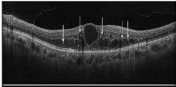
Figure 2: Spectral-Domain Optical Coherence Tomography Image showing various biomarkers, ELM/EZ Disrupted, DRIL Present, SRF Absent, VM: incomplete vitreous detachment