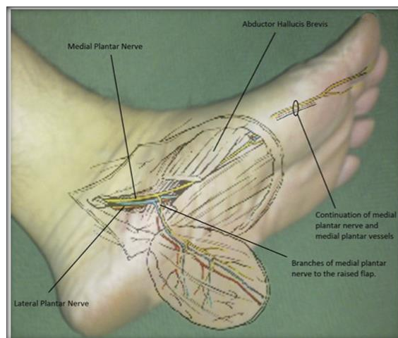
Figure 2: Medial plantar artery flap with pedicle