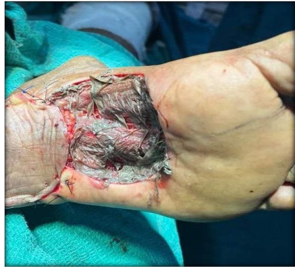
Figure 5: Raw area in the instep region covered with a split skin graft