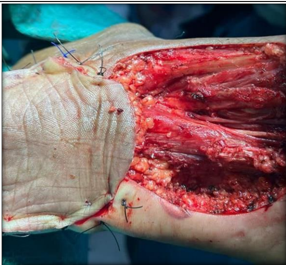
Figure 4: Reconstructed heel with medial plantar flap with raw area showing medial plantar nerve