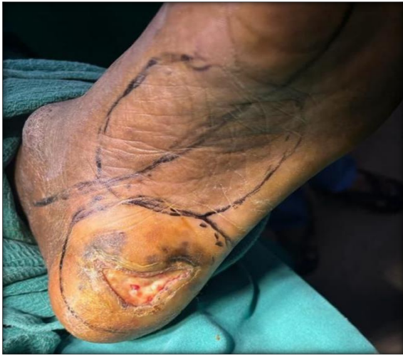
Figure 3: Pre-op flap marking with acral melanoma heel