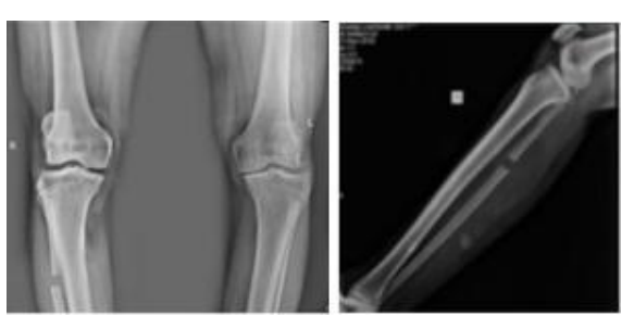
Fig.5 3rd month follow-up X rays