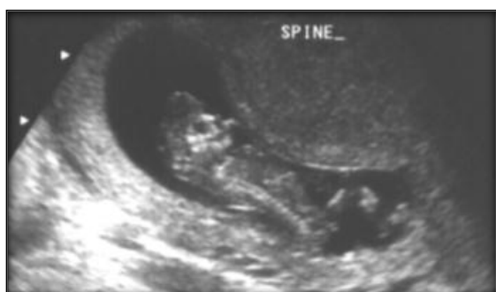
Figure 1 (a): First Trimester scan anomalies- Anencephaly

As per table 4 it was found that family H/O anomalies and positive history of drug intake (anticonvulsants and other teratogenic drugs) had a very high risk for presence of anomalies. Hence first trimester ultrasound is useful in early diagnosis of structural anomalies.