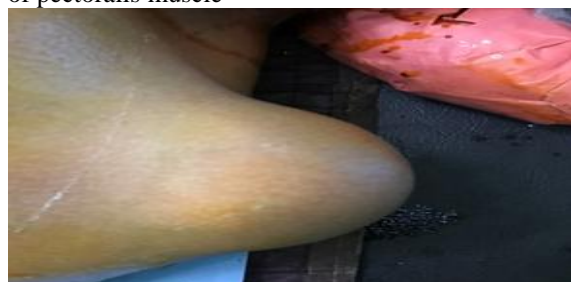
Preoperative picture left shoulder

Case 1: Intramuscular lipoma from clavicular head of pectoralis muscle