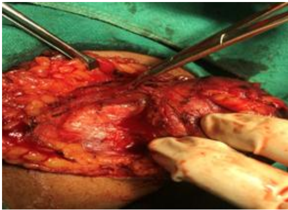
Clavicular head of PM