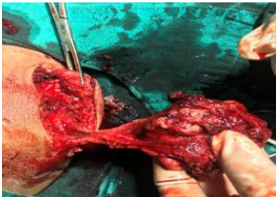
Excision of specimen