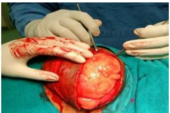
Intraoperative after incision