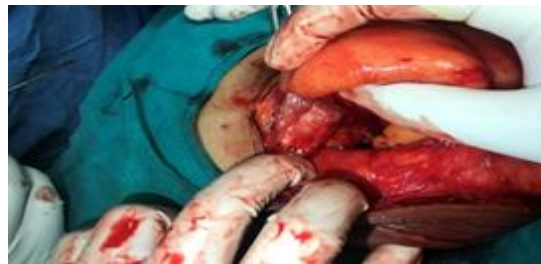
Intramuscular lipoma gluteal region