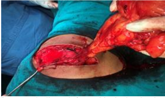
Intramuscular lipoma before excision in gluteal region