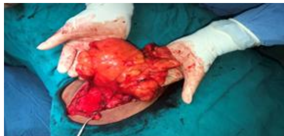
Intramuscular lipoma after dissection